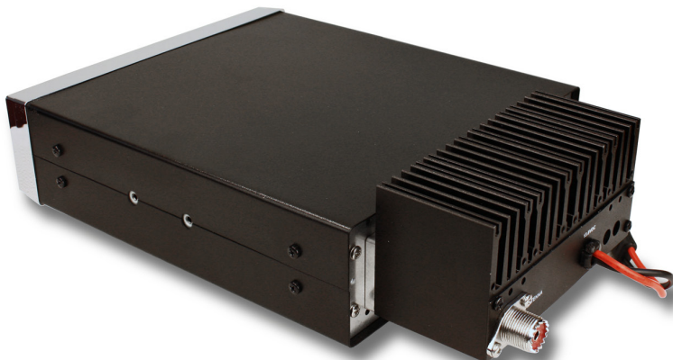
Photo of RFX150 Mounted to a 10 Meter Transceiver.

Available from most Dealers & Distributors!